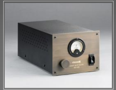
Field Exciter EX-101

With the speaker unit, by and large, efficiency in driving control on the diaphragm plays a crucial role of importance in terms of sonic excellence. Maxonic poured whole efforts, seeking after every possible measure, not only to achieve the necessary, sufficient amount of magnetic flux density but to realize ideal flow of magnetism in the magnetic circuitry, thus deriving the maximum control on the diaphragm.