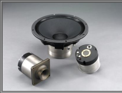
W401(Center) T501(Left) / S301(Right)